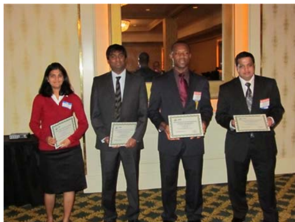
Graduate Student Award Winners