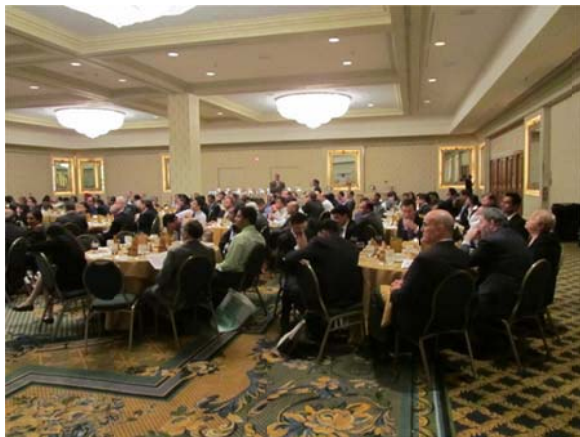
During the speaker sessions