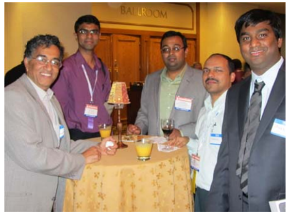
At the reception