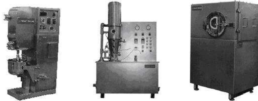
Laboratory High Shear Mixer, Fluid Bed Processor and Perforated Pan Tablet Coater

OFFERS the following Process Equipment plus Extruder-Spheronizers, Tablet Inspectors, Roller Compactors/Mills and Spray Dryers for Research or Production